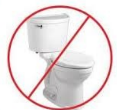
NOT a Trashcan

The next monthly meetings will be January 26 2015 and February 23 2015 at 4:00pm